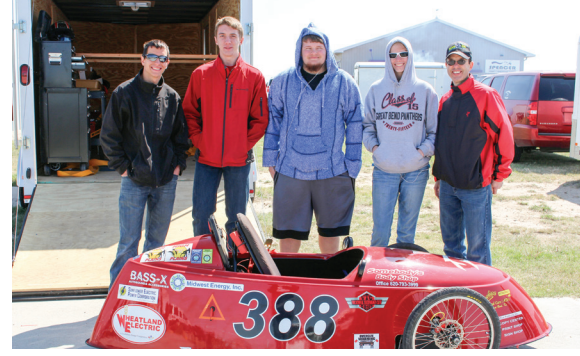
Each year, Wheatland sponsors the ElectroRally program for local high school students.