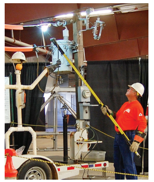
Lawrence Lubbers demonstrates the effect of an electrical current on the human body using a grapefruit, which is then split open for students to view the damage.

The safety demonstration was part of the Kansas Energy Expo spon-